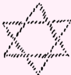
Second Logos Macrocosm