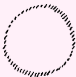
First Logos God

The images in this newsletter come from https://anthrowiki.at/Logos .