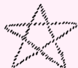
Third Logos Microcosm